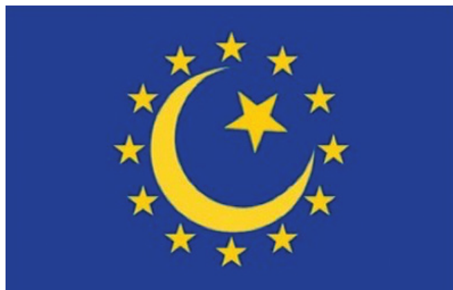
The conspiracy theorist's flag of 'Eurabia'

One significant impact of this trope is that majoritarian extremists outside government are likely to use it as a way of suggesting that they are the ones under attack—and that their anti-Muslim prejudice (and violence) is defensive. Organisations that are in fact extremist can therefore paint themselves as legitimate defenders of beleaguered cultures, under attack from a Muslim other. Thus, the same sort of language of defence (usually of culture, religion or identity) is found across the world from the UK (the English Defence League and Britain First) to India (the Rashtriya Swayamsevak Sangh and Bajrang Dal), Myanmar (969) and Sri Lanka (Bodu Bala Sena). 57