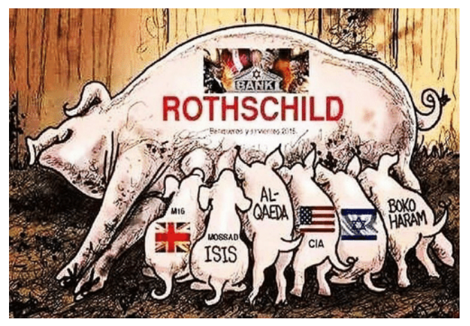
A final and recent example is the way that the term "Zionist" is used. This is often used as another code for "Jew" in anti-Semitic narratives online. At the same time, there is an increasing use of the term "Zio" (a term originally used as anti-Semitic abuse by the far right), which has increasingly been used in more mainstream political narratives in the UK.

This cartoon, adapted from one making a point about relationships between Salafi-jihadi terrorist groups, suggests that the Rothschilds' influence feeds the intelligence services of a number of countries, as well as Islamist terrorist groups.<sup>19</sup> The idea that ISIS and al-Qaeda are operating under the control of an international Jewish conspiracy also has a good deal of traction on the Internet.