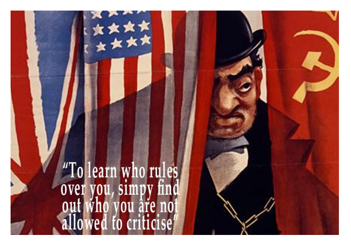
This image is a good illustration of this point - although originally from mid-20th century, this particular image has been reused by a modern website. The concept is that Jews are using their financial power to 'stand behind' and control governments around the world.

This took on a new emphasis in the 19th and 20th centuries, and continues right up to the present day with the belief that a secret cabal of Jewish bankers controls the world financial system and uses it to create more wealth for themselves, while oppressing other communities. An implication of this is that economic crises, which often create political unrest, can be blamed on Jews.