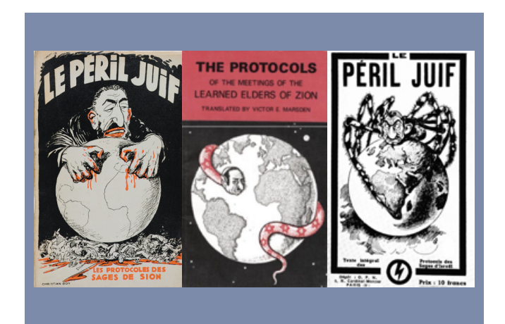
Different editions of The Protocols, some using poisonous animal imagery<sup>14</sup>

This trope is often closely connected to trope 3, as it assumes the manipulation of political power through wealth. Many of these ideas are rooted in an anti-Semitic text called The Protocols of the Elders of Zion . This text was produced in Russia during a period of anti-Semitic persecution and purports to be the notes of a secret Jewish group that is plotting to take over the world, with a particular emphasis on secret political and economic domination.